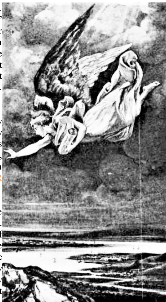
THE EVERLASTING GOSPEL

We inquire, first, respecting the past. The very nature of the message forbids the idea that it could have been given in the apostles' days. They did not proclaim that the hour of God's Judgment had come. If they had, it would not have been true, and their message would have been stamped with the infamy of falsehood. They did have something to say, however, respecting the Judgment; but they pointed to an indefinite future for its accomplishment. In Matthew 10:15; 11:21-24 , a quotation from Christ's own words, the judgment of Sodom and Gomorrah, Tyre, Sidon, Chorazin, and Capernaum, was located indefinitely in the future from that day. Paul declared to the superstitious Athenians that God had appointed a day in which he would judge the world. Acts 17:31 . He reasoned before Felix "of righteousness, temperance, and judgment to